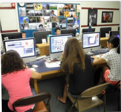
VIDEO ESL CLASS

Domingo's experience at Brewster Academy Summer Session (BASS) is reflective of many student comments about learning and fun on our safe and beautiful campus on the shores of Lake Winnepesaukee in central New Hampshire. Students learn both in and out of the classroom, and make friends from all over the world. BASS offers a combination of academics and adventure recreation.