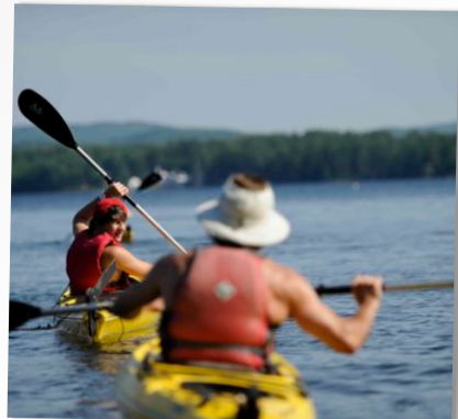
AN AFTERNOON KAYAK